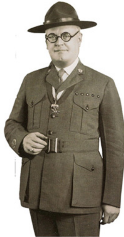
James E. West

Hired on a six-month trial basis, Dr. West stayed on as Chief Scout Executive for 32 years, helping build the BSA into the nation's most successful youth organization.