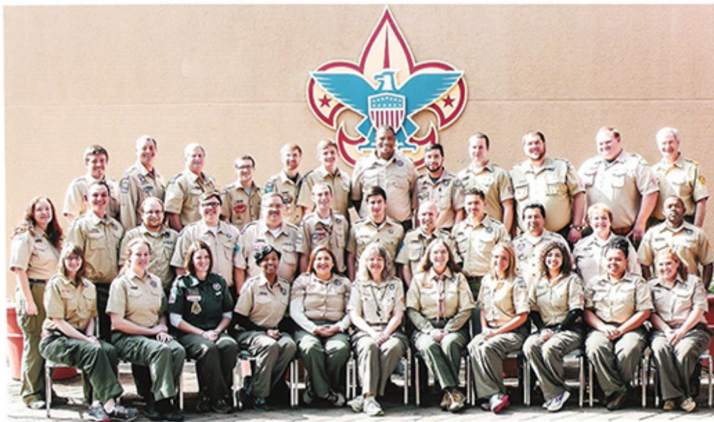
Scouters completing coursework at the BSA's Center for Professional Development