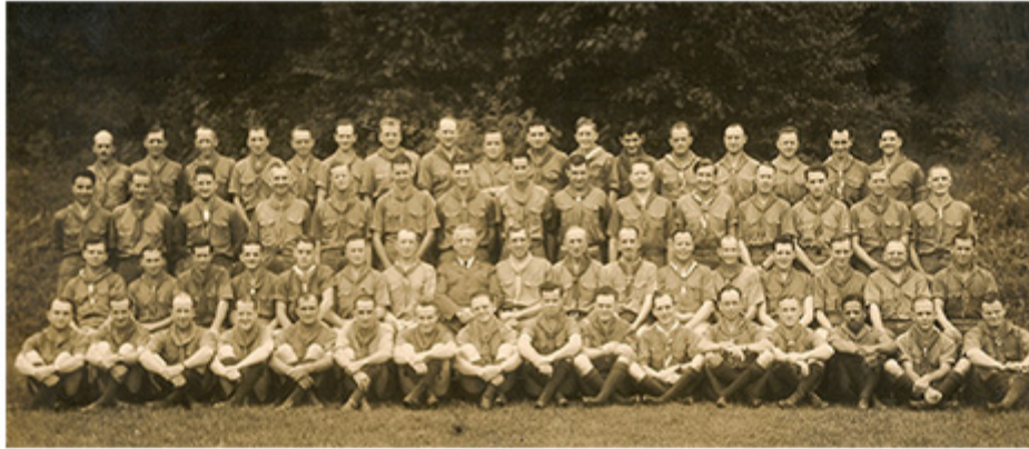
District Executive Training Course - Schiff Scout Reservation - 1946

Training today takes place at the BSA's Center for Professional Development in Westlake, Texas, about fifteen miles west of the current National Office. From introductory courses to advanced seminars, the Center prepares new executives for challenges in the field and hones the skills of those with years of experience.