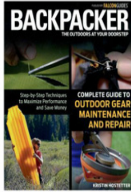
Complete Guide to Outdoor Gear Maintenance and Repair Book

to many parts of America. Here's a sampling of what you can find to help you find your way: