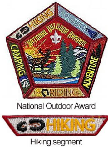
National Outdoor Award