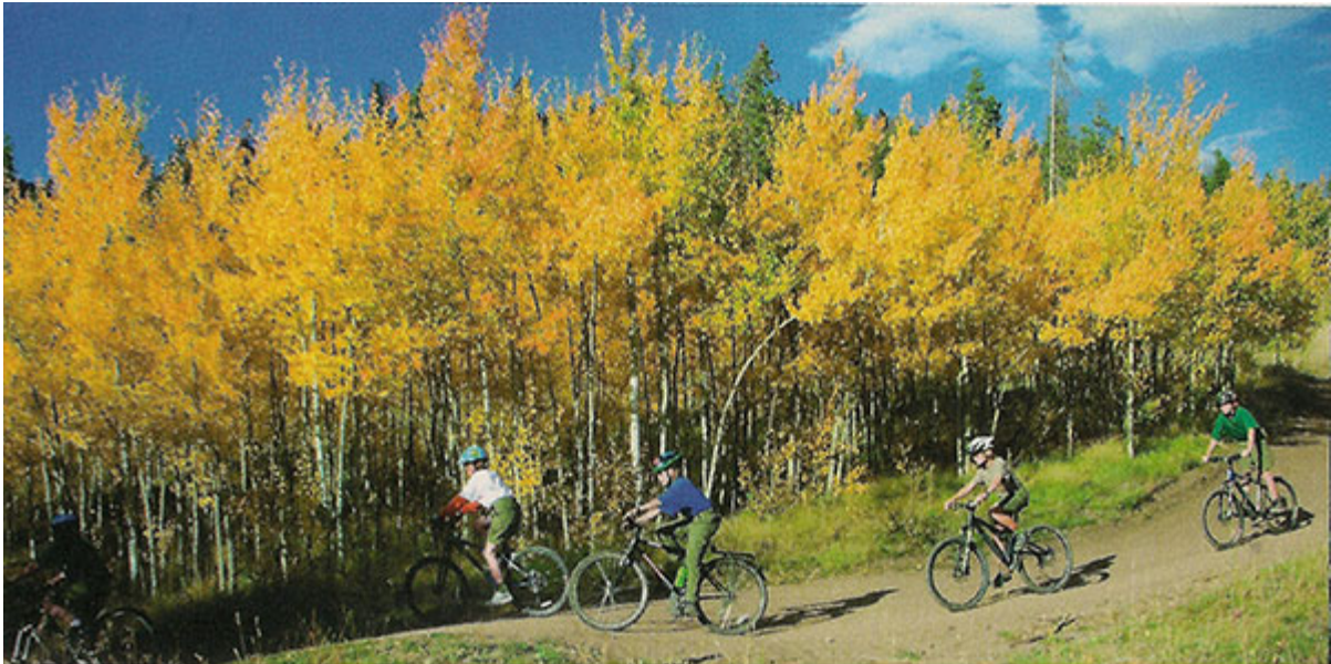
Scouts roll through an autumn forest

Your next hike might be with your Boy Scout troop, Cub Scout den, or Venturing crew. Perhaps your destination will be a historic location, a picnic ground, or a place to view wildlife. The point is to have fun, build friendships, and cover some miles.