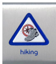
Cub Scout Academics and Sports Belt Loop - Hiking

The BSA encourages hiking by including it as a Cub Scout activity, as a requirement for Boy Scout rank advancement and the Hiking merit badge, and as a National Outdoor Award segment.