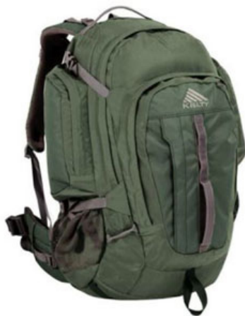
Kelty® Day Pack

ScoutStuff.org features most of the Basic Essentials and many more items for making your outdoor adventures comfortable, and safe. To carry your hiking needs, check out these versatile packs selected by the BSA's ScoutStuff.org for day hikers everywhere: