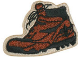
Embroidered Hiking Boot Pin