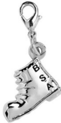
Hiking Boot Charm

Of course, the key to happy hiking in the autumn - or any time of year - is simply to go do it. Get started. Set off to see what's around the next corner, and soon you can find yourself discovering the world.