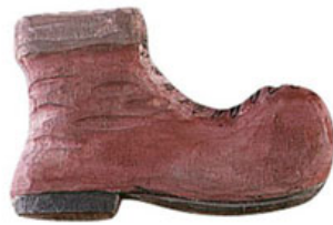
Wood Carving Neckerchief Slide Boot