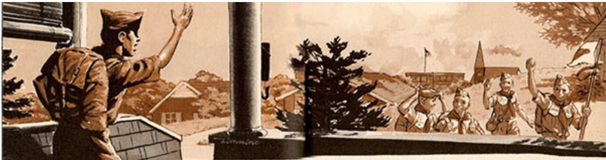
Hiking has always been an exciting part of Scouting

Your next hike might be with your Boy Scout troop, Cub Scout den, or Venturing crew. Perhaps your destination will be a historic location, a picnic ground, or a place to view wildlife. The point is to have fun, build friendships, and cover some miles.