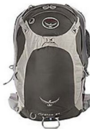
Osprey® Stratos 24