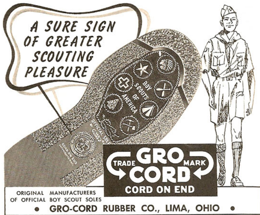
1959 Boy Scout Handbook advertisement

Footwear options have continued to grow as outdoor equipment companies market a wider range of boots and hiking shoes. The 1985 Fieldbook showed the two serious options of that time. They are still good choices today.