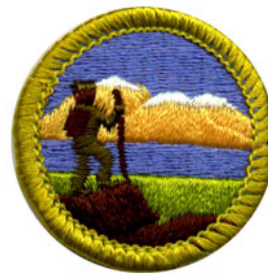
Hiking Merit Badge